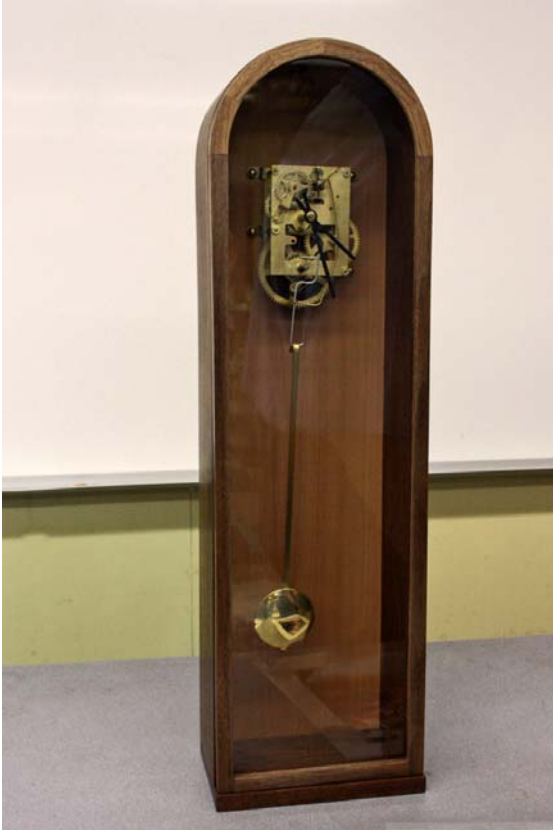
Bob Barnett showed a glass front clock