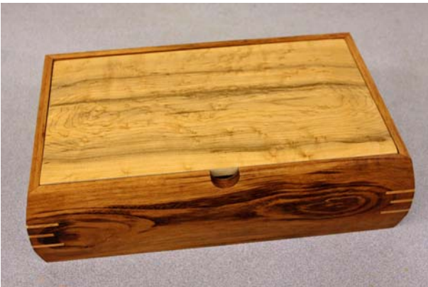
Peggy Gipps showed a Tiger Wood/Maple box