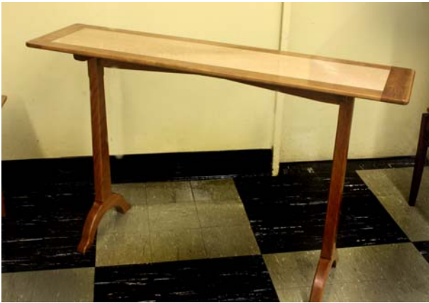
Bruce Woods showed 2 tables, Cherry and figured Maple, Shaker Style with hand-cut dovetails and Sam Maloof Finish