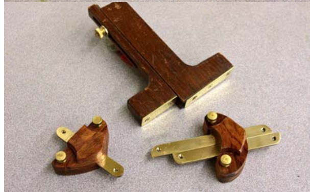
Bruce Thom showed a couple of boxes, some puzzles, and measuring tools