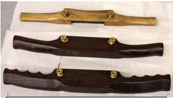
Gary Foster showed his spoke shave tool collection