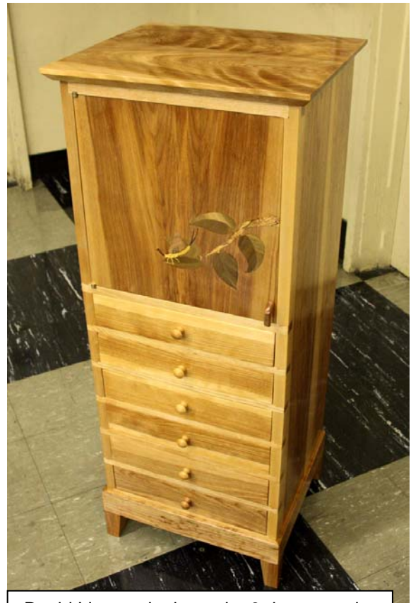
David Lipscomb showed a 6 drawer cedar lined Cabinet for Fly Tying Supplies with Marquetry Design on the cabinet doors.